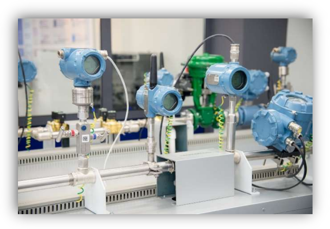
Fig. 2. Emerson PlantWeb Center of Competence